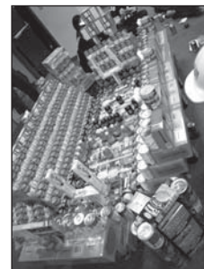
▲ The winning Bechtel "sculpture" was a football field created with various food items by some football fans. Many of the winners donated half, if not all, of their prize money back to the Frederick Rescue Mission.