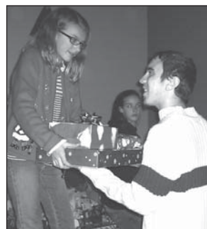
▲ Each resident of the Beacon House received a gift from Middletown United Methodist Church during the annual Christmas Party.

Those who helped make our 2008 Christmas Party very special: